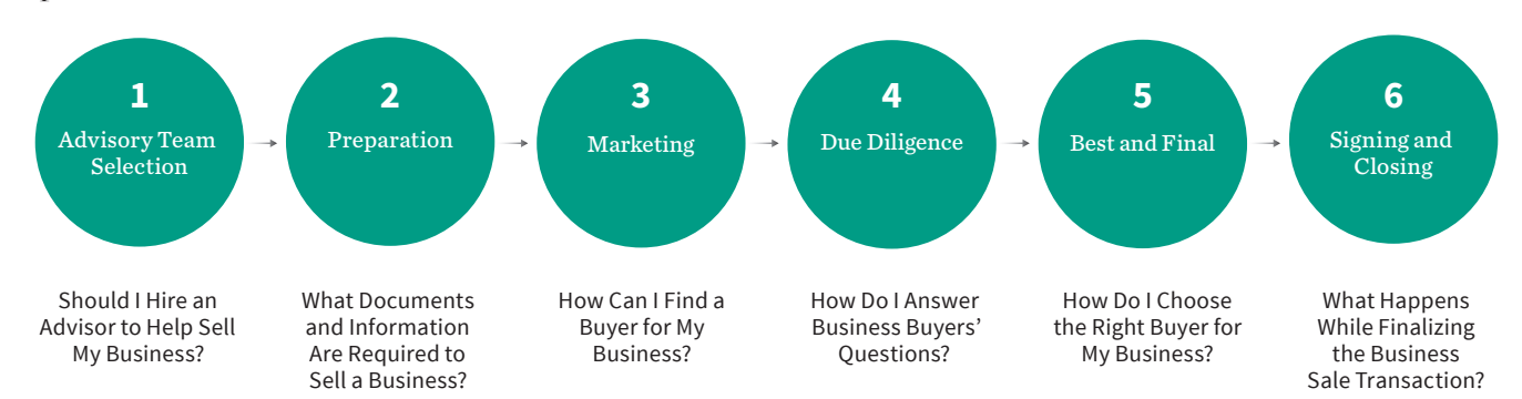
EXHIBIT 1 Steps of a Sale Process

Follow-up meeting: Many potential buyers will ask to hold follow-up meetings with the executives to go over any questions that arise when reviewing the data room.